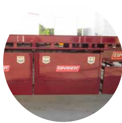
Toolboxes Jumbo toolbox

The need to constantly solve problems drives the process of innovation. Client feedback is invaluable – our clients operate the equipment, if they suggest an improvement or identify a problem we can implement changes and modify the design to be more productive.