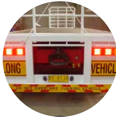
Road Train Rear crossmember with air and electrical to the rear