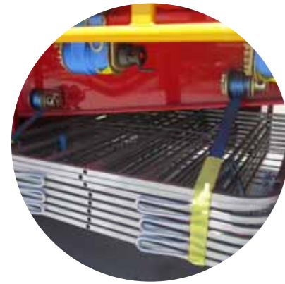
Gates Steel and Aluminium gates and storage