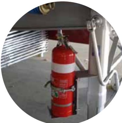
Dangerous Goods Fire extinguishers and DG signage