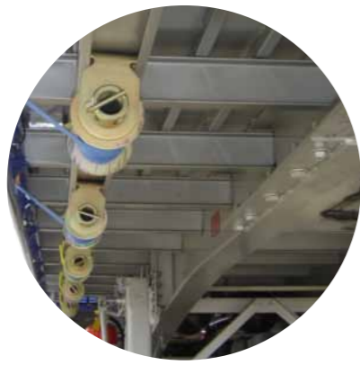
Loadbinders Manual and ratchet style fitted in track